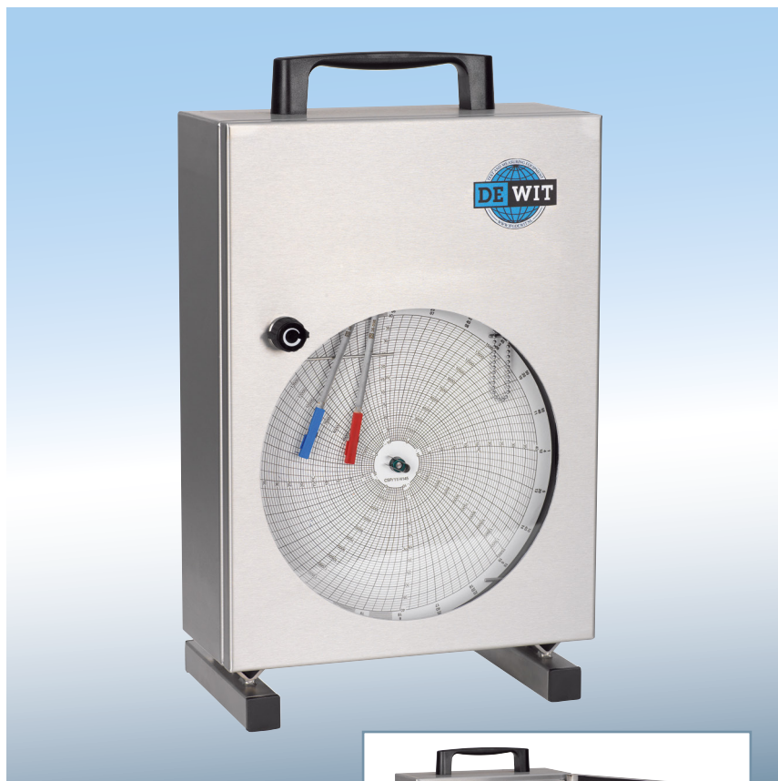
Rectangular 12" Chart Recorder De Wit model PP-12-T